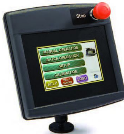
Start-up menu options. 启动菜单选项