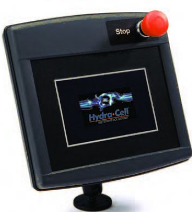
Opening screen-touch to activate. 启动显示器