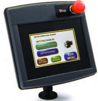
Sample menu for batch operation. 批处理菜单示例